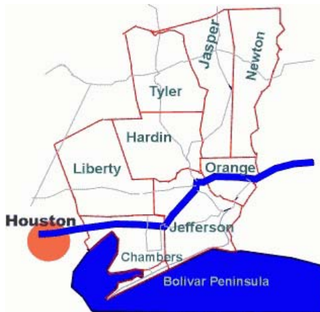
Fig. 2 Map of Southeast Texas under the coverage of POST